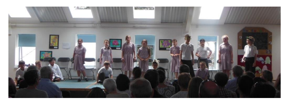
Every year these two events showcase the talent our children possess in music, dance and speech.