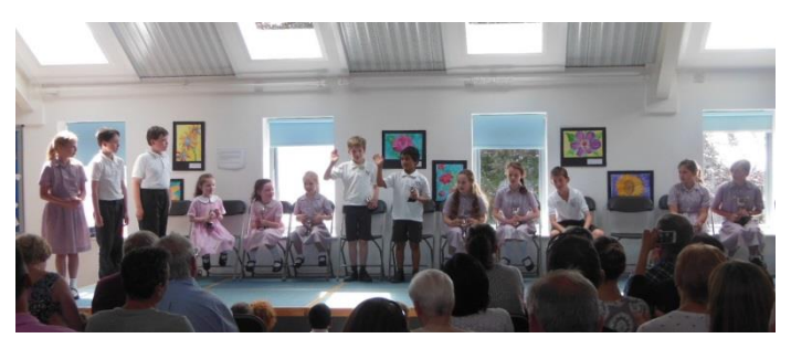
The audience were very appreciative delighted by the varied entertaining pieces from FS2 through to Year 6. Well done to all the stars of the future.